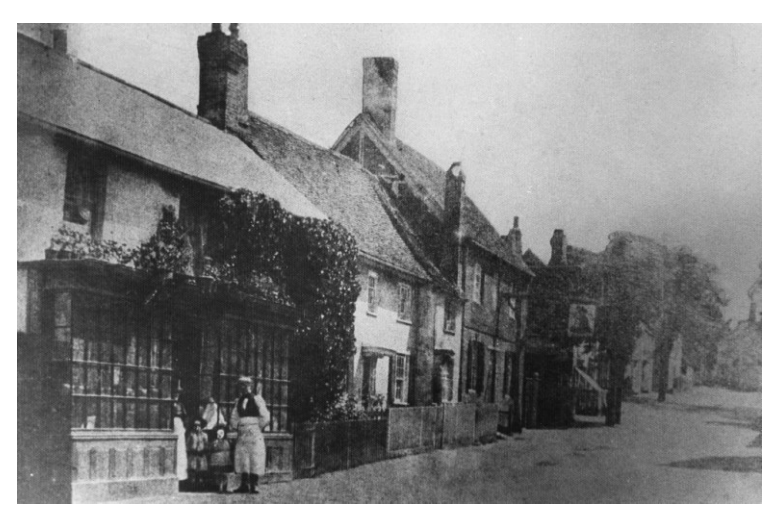
The sign for the Bell is on the third house, c.1890s

A long-established and significant village inn, the Bell has a long history. The building is a timber-framed house of the 16th or 17th century with a Georgian frontage and is Grade II listed. Earliest records suggest that it started as part of a farm with barns, outbuildings and a maltings that enabled the brewing of its own ale. A sizeable establishment, it continued to offer hospitality for village events and a base for Friendly Society meetings, even the occasional inquest, until well into the 20th century. A series of auctions and sales meant that the property diminished to the single building we now recognise from the bracket for the inn sign of the former Bell & Crown. Now a private house, it retains the name Crown House at 27 High Street.