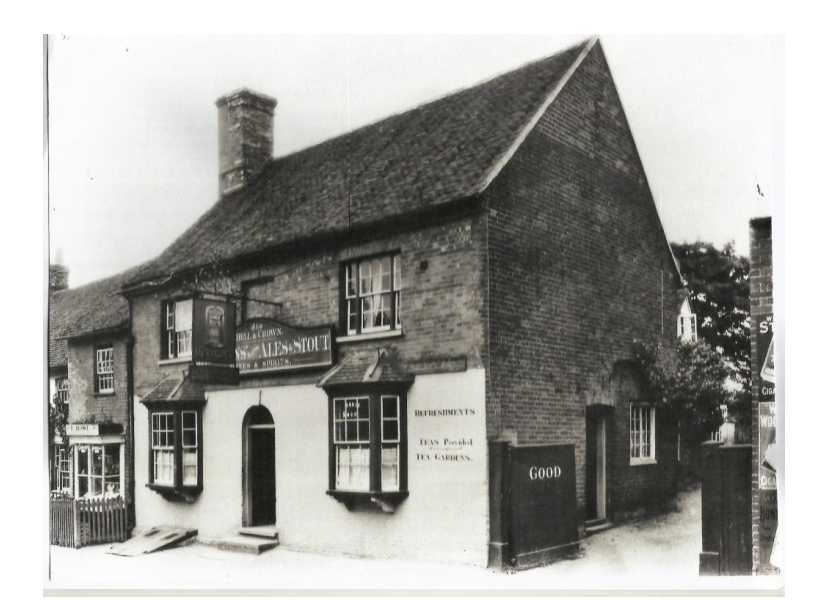
The Bell & Crown in the mid-20th century