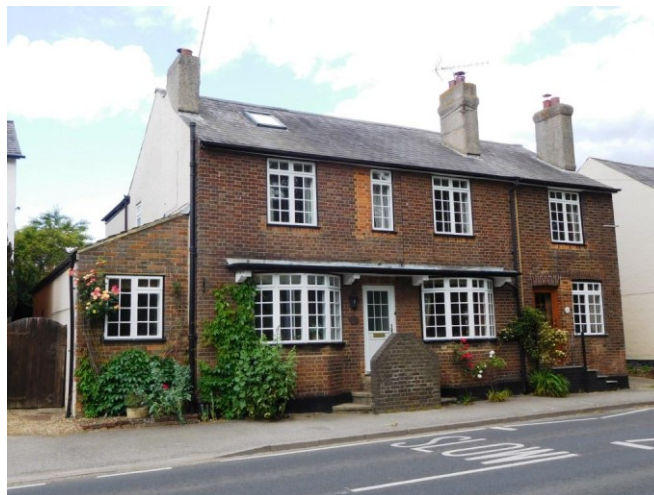
The Rose & Crown today – two private houses

Bearing this in mind, there appear to have been two pubs at The Folly. The Hertford Mercury dated 27 August 1859 included an advertisement for an auction of 30 plots of land at The Folly 'very pleasantly situated on the Wheathampstead and Luton road, near the Folly and Rose and Crown public houses'. The pub later known as the Royal Oak was open at this date so this account is based on the conclusion that records that refer to a pub as The Folly relate to the Royal Oak while the Rose & Crown was usually called by name.