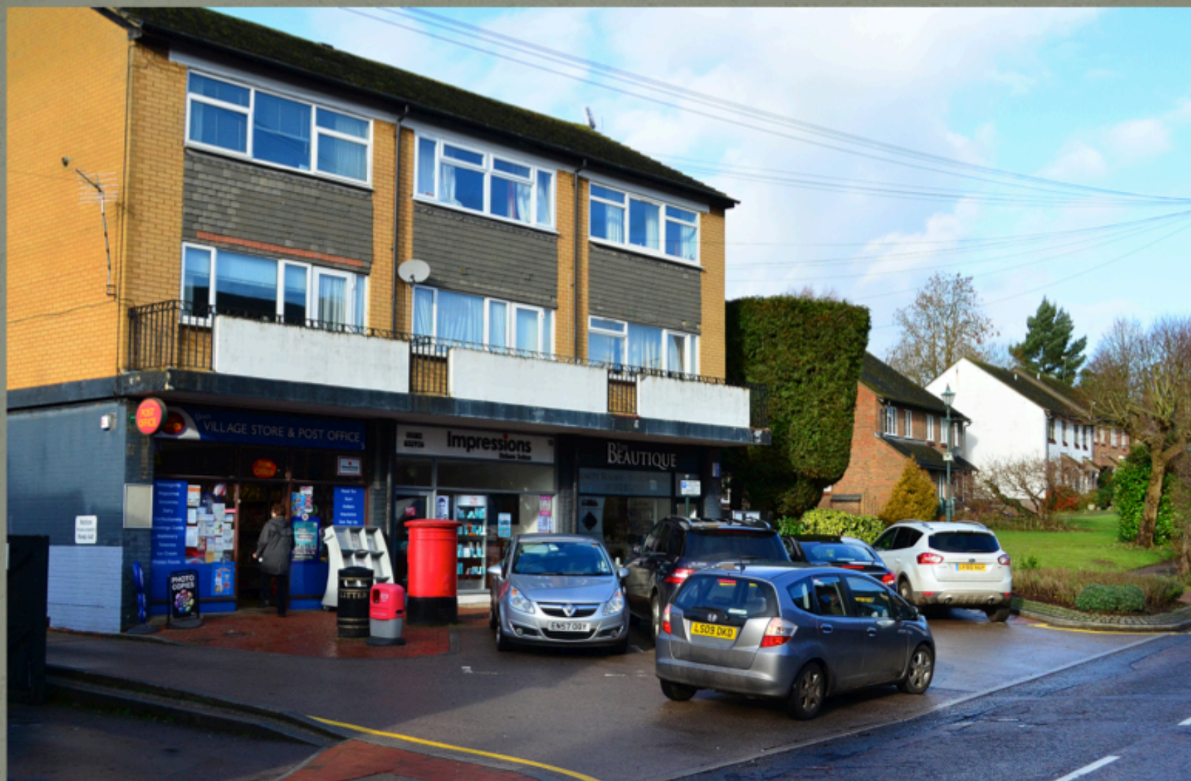
The site of the two cottages is now the frontage of three shops that includes the post office.