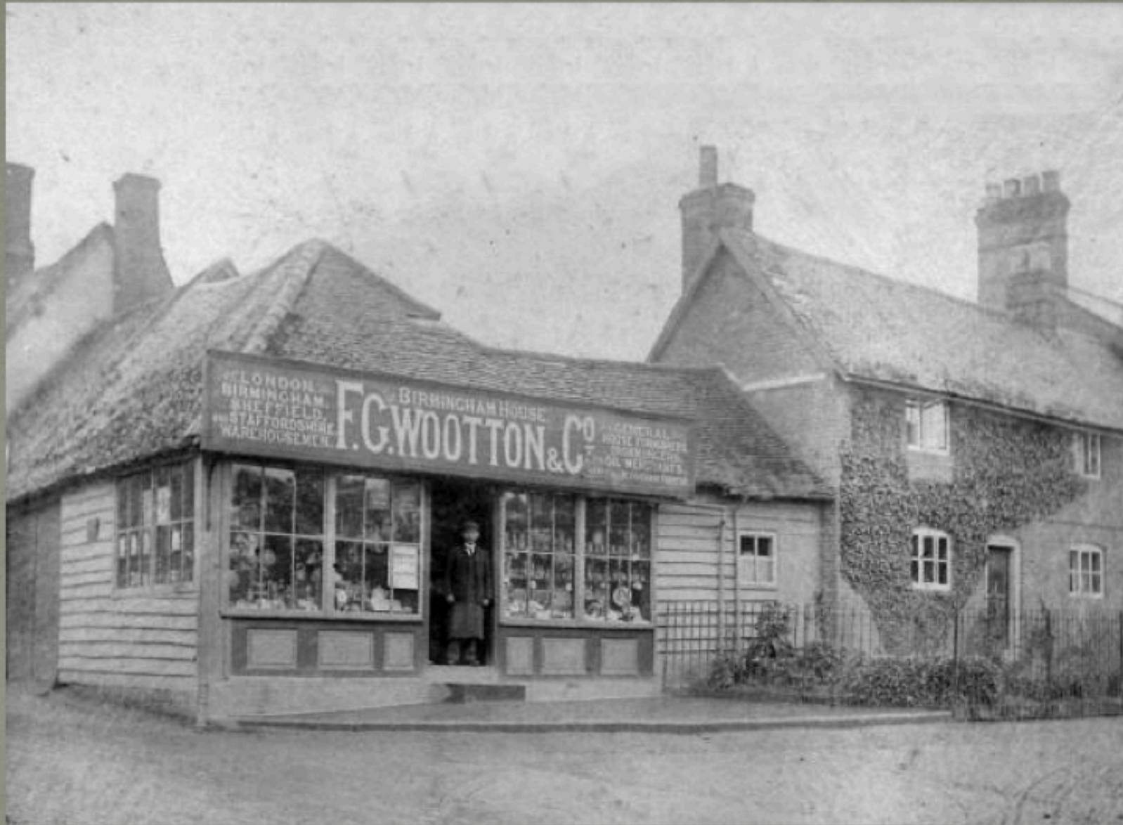
FG Wootton the ironmongers was located on the corner of Church Street, next to The Swan. It burnt down in 1910 when the oil store in the shop caught fire.