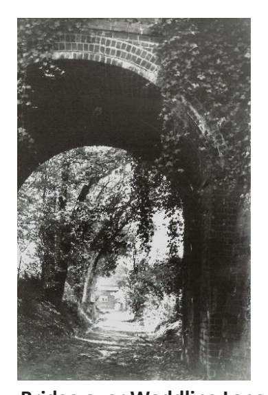
Bridge over Waddling Lane