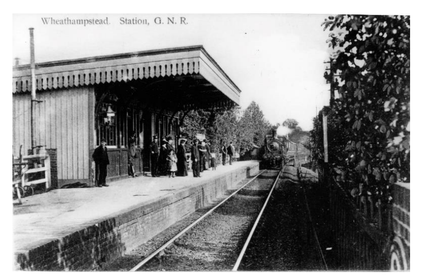
Wheathampstead Station in about 1905

In the early days, when the train was still a novelty, people would walk to Ayot Station for a ride back to Wheathampstead – just to say they'd "done it".