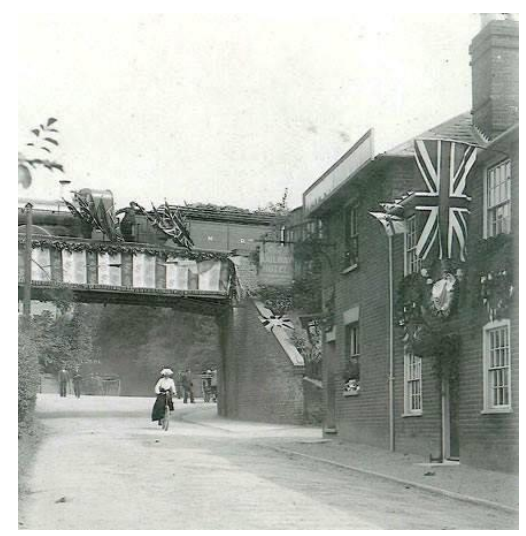
Station Road railway bridge in about 1905

Wheathampstead Station was opened in 1860 as a station stop on the Hatfield, Luton and Dunstable Railway. The sidings and goods yard were on the far (west) side of Station Road with a bridge across the road. There was another bridge across Waddling Lane on the east side.